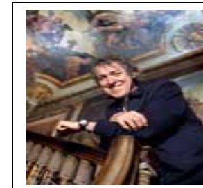
Griff Rhys Jones